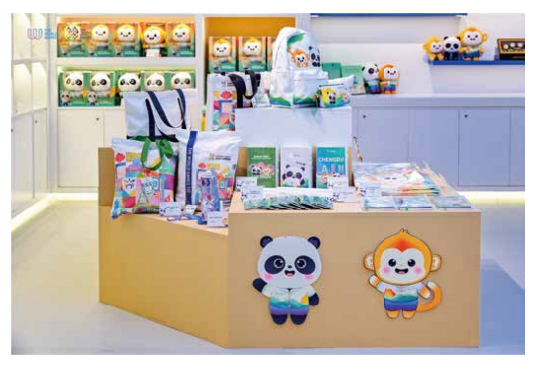
Stationery Section: TWG 2025 Chengdu Mascots-Related Backpack/Canvas Bag/Notebook/Ballpoint Pen