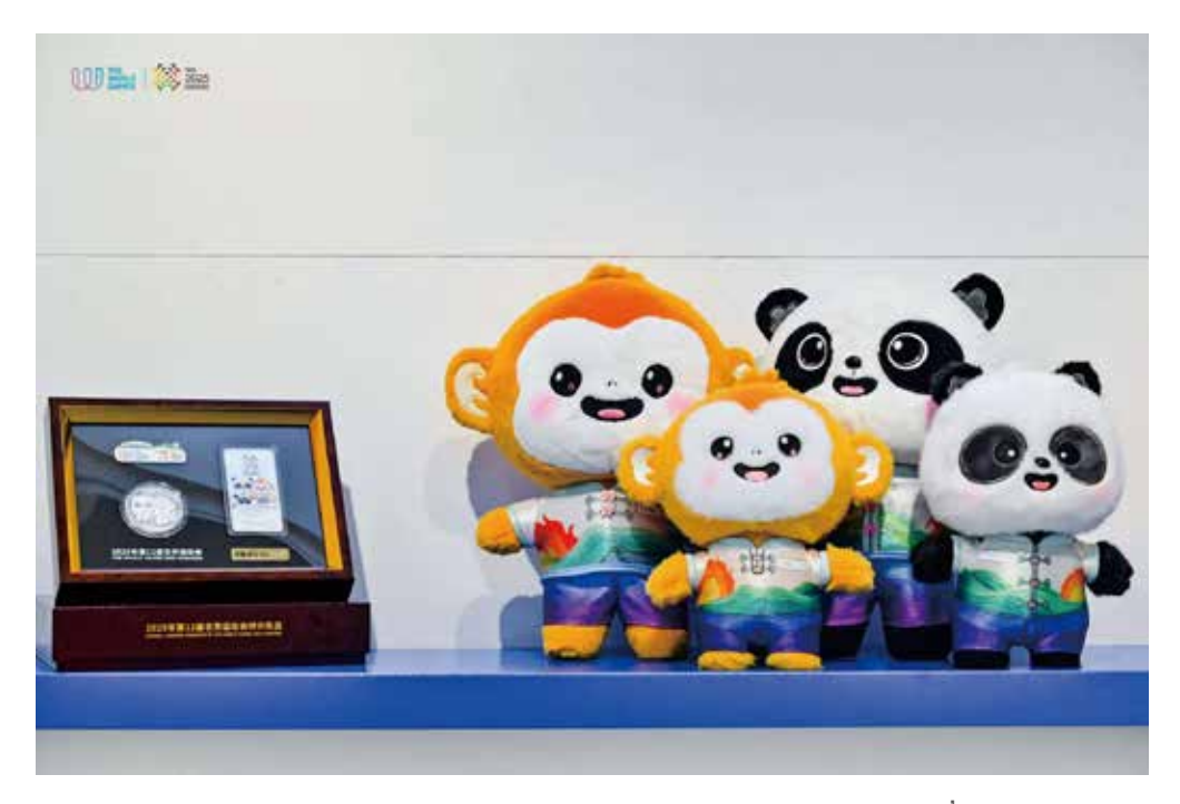
Left: TWG 2025 Chengdu [Impression: Chengdu] Limited Edition Collector's Ornaments Right: Mascot Plush Toys