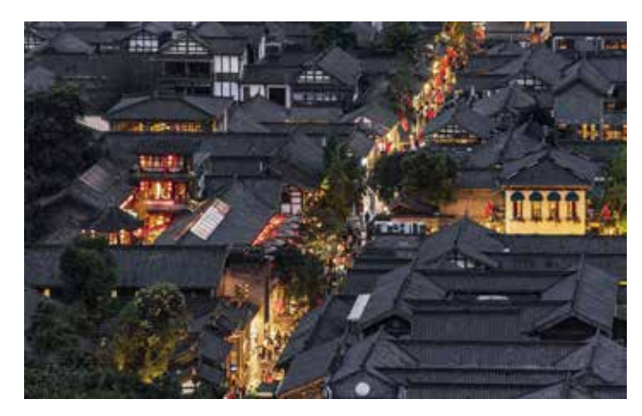
Taikoo Li Chengdu

Today's Chengdu values opening up with global vision. In total, 23 countries have been approved to establish consulates in Chengdu. And the city has established sistercity and friendship city relations with 112 cities around the world, and trade relations with 235 countries or regions worldwide. Chengdu is the third city having two international airports on the Chinese mainland, following Shanghai and Beijing, and the 19th city with two 4F airports in the world. It has opened 71 regular international/regional passenger and freight flight routes. In addition, it runs trips to 112 overseas cities made by international railway services.