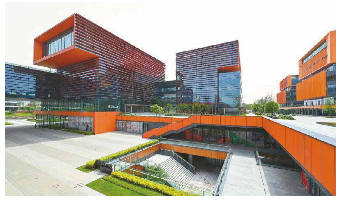
Main Media Centre

On the periphery of the MMC, there will also be a media transportation hub to provide shuttle buses travelling to and from the media hotels, media centers in competitions venues and VOCs of non-competition venues including the venues for opening and closing ceremonies. Technological support will be provided in all respects, including "media+" dedicated communication, broadcast convergence network and competition live-streaming to new report and broadcast.