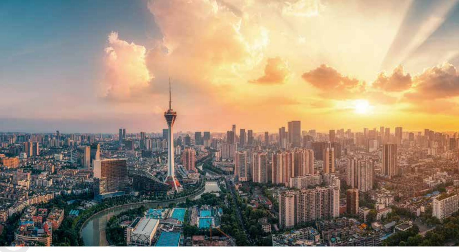
Streetscape of Chengdu