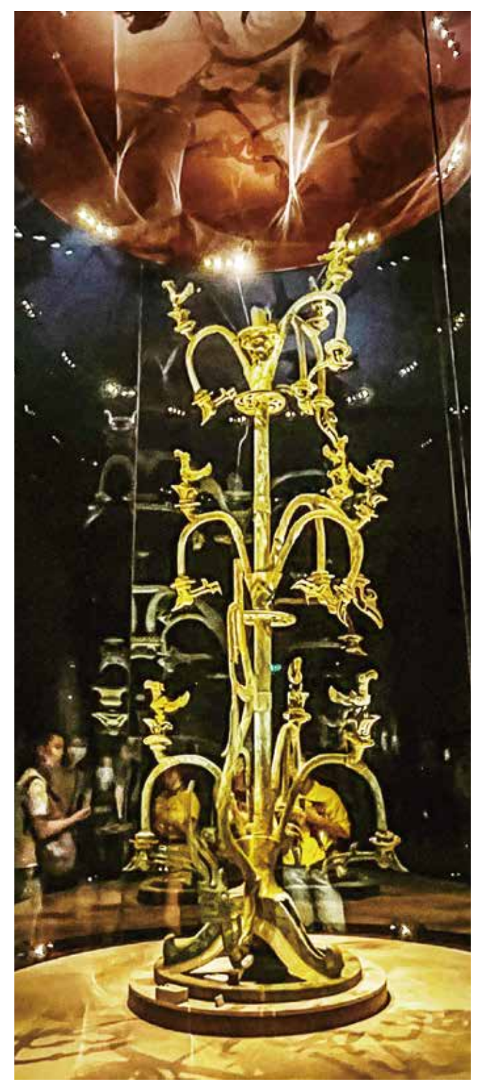
Sanxingdui Bronze Sacred Tree

The province also abounds in tourism resources, among which there are World Natural Heritage Sites including Jiuzhaigou Valley, Huanglong Scenic and Historic Interest Areas and Sichuan Giant Panda Sanctuaries, the World Cultural Heritage Site, Mount Qingcheng and the Dujiangyan Irrigation System, and the World Cultural and Natural Heritage Site, Mount Emei Scenic and Leshan Giant Buddha Scenic Area.