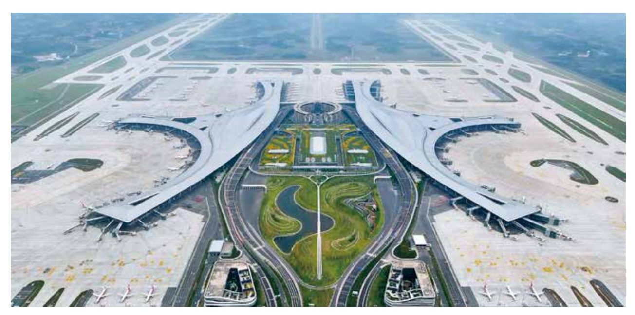
Chengdu Tianfu International Airport

With convenient transportation infrastructure, Sichuan is a transportation hub in southwest China. It has two international airports (Chengdu Tianfu International Airport and Chengdu Shuangliu International Airport), with an annual passenger throughput of 75 million in total. The non-stop high-speed railway service between Chengdu and HKSAR, China has been provided since 1 July 2023, with a total of 1.5 million passengers transported so far. In addition, it runs nearly 30,000 trips made by the Chengdu International Railway Service.