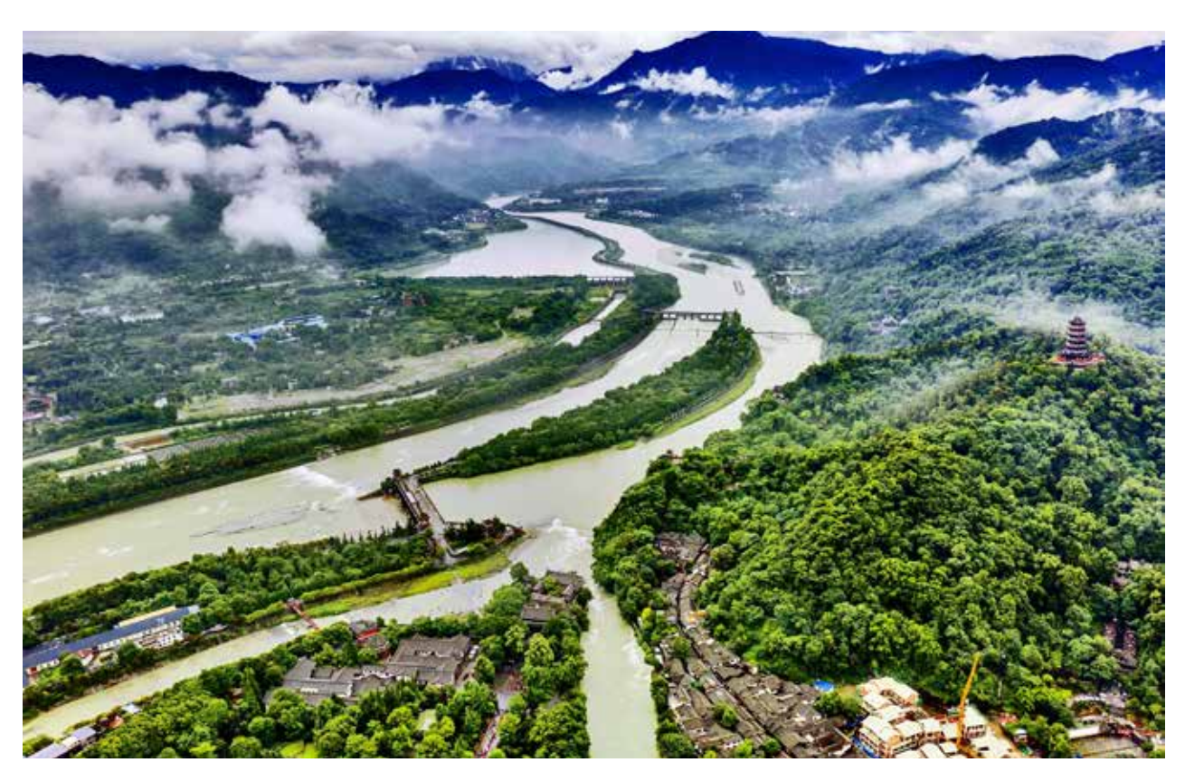
Dujiangyan Irrigation System