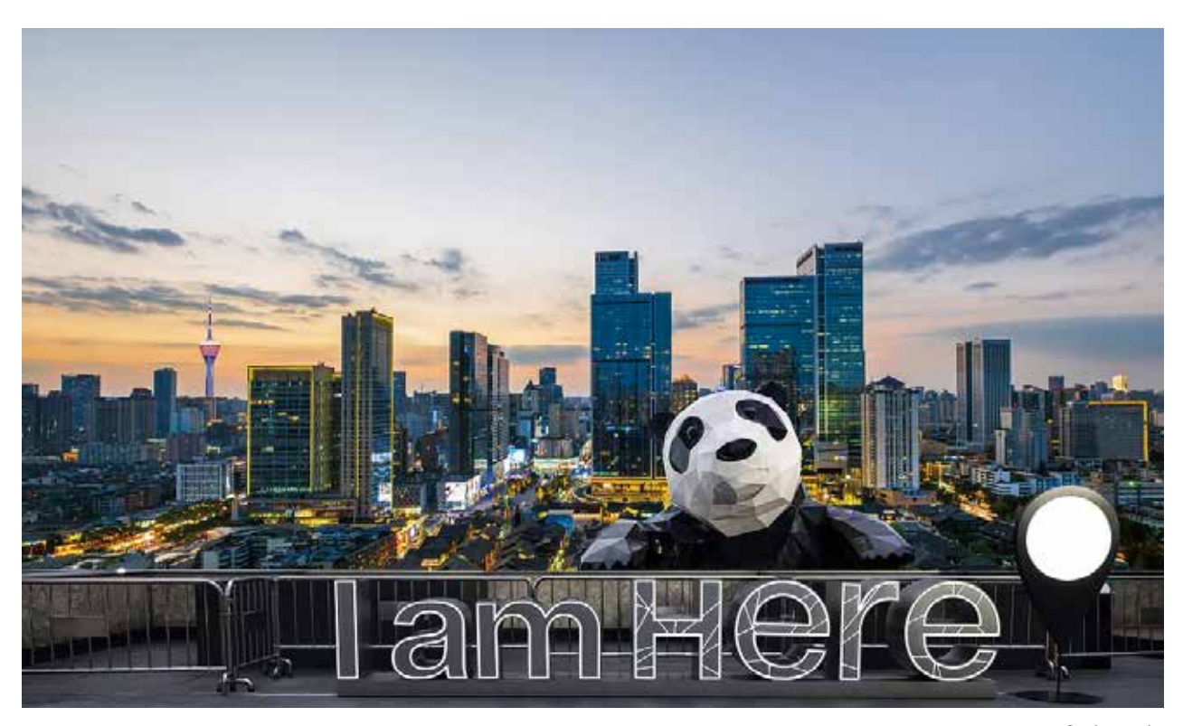
Streetscape of Chengdu

Chengdu is the hometown of the Giant Pandas and enjoys over 4,500 years of civilisation history and more than 2,300 years of history as a city, manifesting a perfect mixture of history, culture and modernity. Being the capital of Sichuan Province and a central city in southwest China, Chengdu covers an area of 14,300 square kilometres and has a permanent population of 21.4 million, which has turned it into a mega-city known to the world. It is also an important centre of economy, science and technology, finance, cultural creativity, and international exchanges in China, and an international hub for comprehensive transportation and communications.