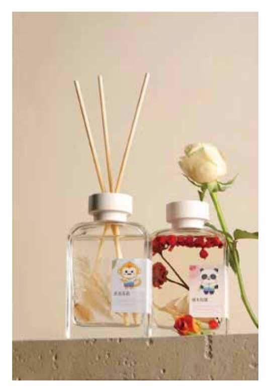
Nature & All Things: TWG 2025 Chengdu Aromatherapy Scents