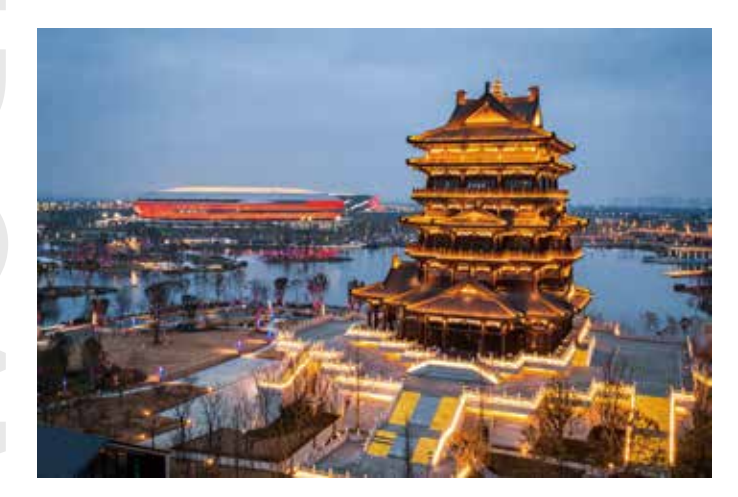
Dong'an Lake Sports Park